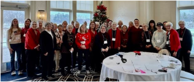
Branch members at our December meeting

We all had a great time at our Holiday Luncheon at the Midland Country Club on Thursday, December 18th. Everyone was decked out in holiday attire and spirit. We had four guests present and engaged with us.