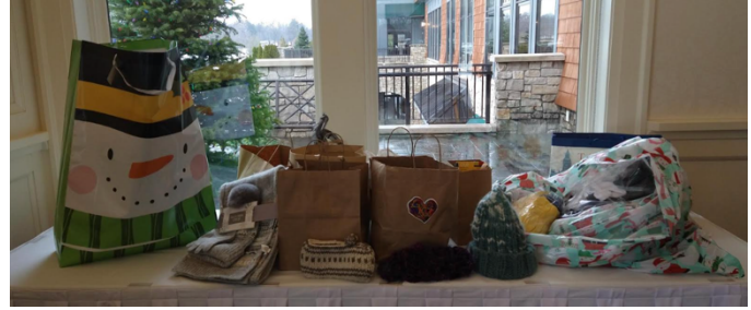
Our donations to the ETC of Midland

This year we collected two huge bags and several smaller bags of hats, gloves, scarves and cozy socks for the students of Education and Training Connection (ETC) of Midland. Thank you to all who donated to this worthy cause.