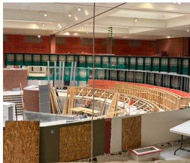
Some areas are reminiscent of the previous space