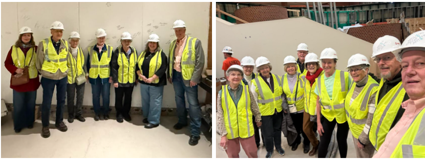
Pictured above are both groups of AAUW members on their tours