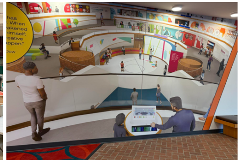
It was also exciting to see the final vision for the space