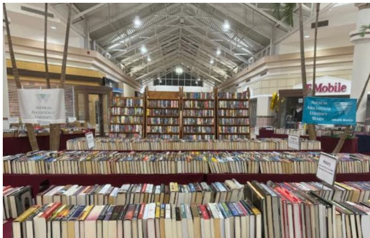
The result of so much hard work by our members