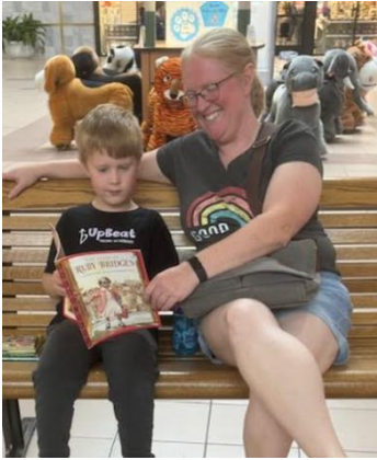
Some quality time with a UBS book