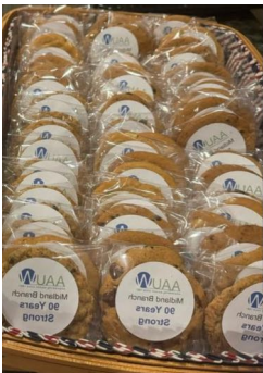
Delicious cookies we shared with shoppers.