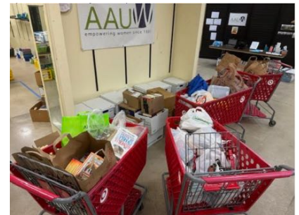
Carts filled with books!