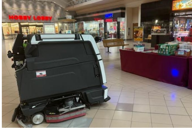
Even the mall robot wants to come to our sale!

We all know the great things that our AAUW Midland Branch is able to do with the funds raised from the Used Book Sale.